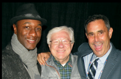
ALOE BLACC WITH CHAS AND MLB'S KEN KRASNER

SELECT ARTISTS ASSOCIATES, LLC 13880 N. NORTHSIGHT BLVD. SUITE C-101 SCOTTSDALE, AZ 85260