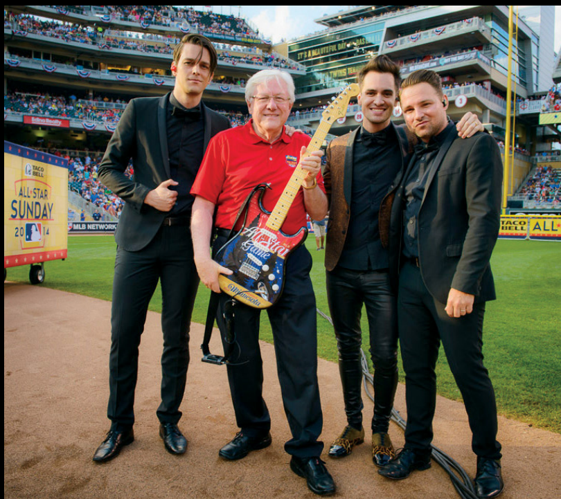
CHAS WITH PANIC! AT THE DISCO